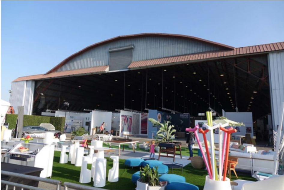
WestEdge Design Fair