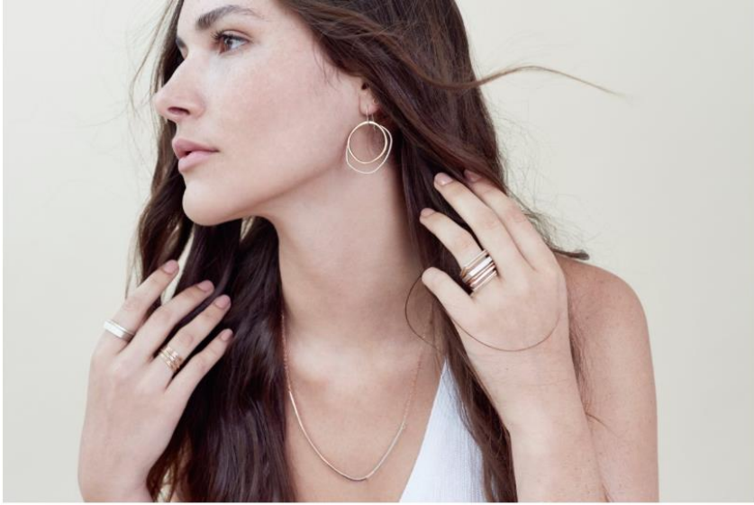
Colleen Mauer Designs