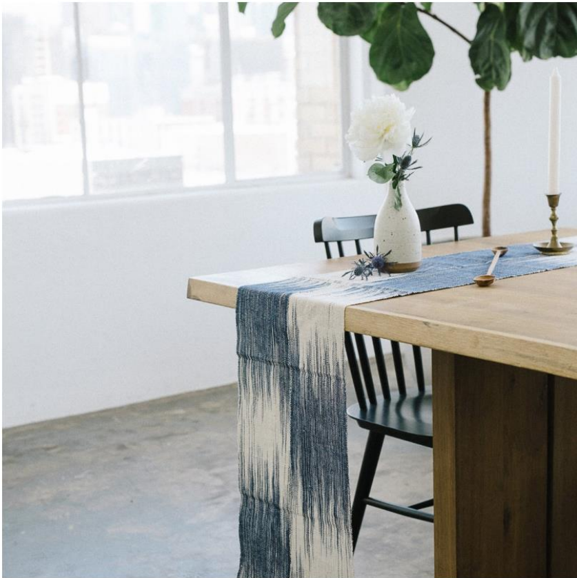
Five and Six Textiles