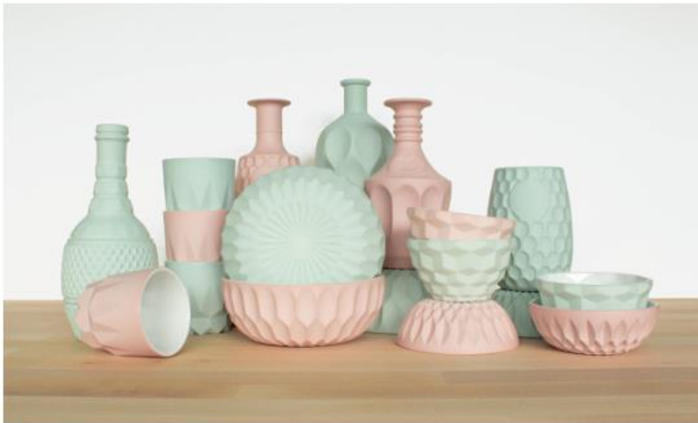
Tiny Badger Ceramics