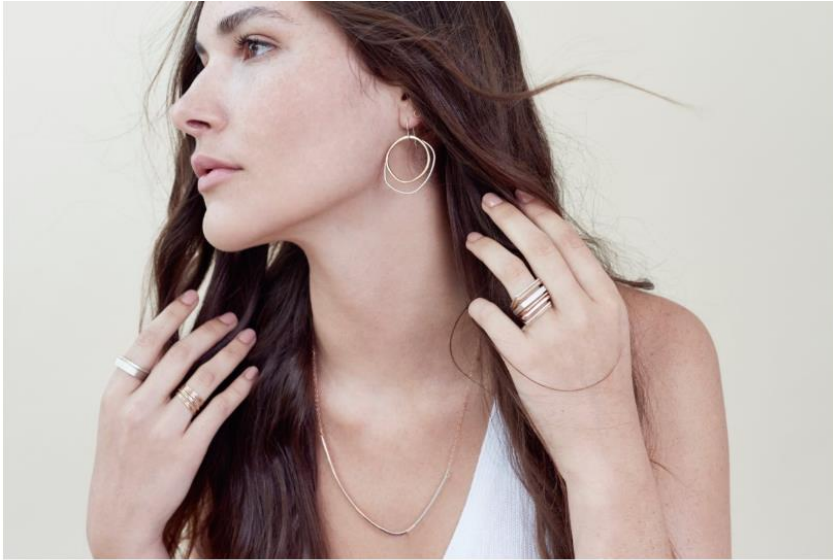
Colleen Mauer Designs